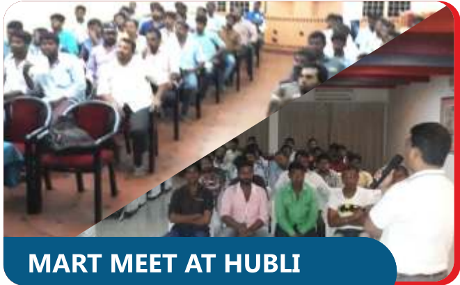
MART MEET AT HUBLI

Feel free to give your views, feed back, ideas and opinions related to this field. You may be the next face in our news letter.