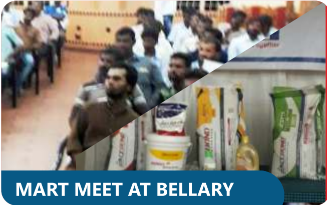
MART MEET AT BELLARY