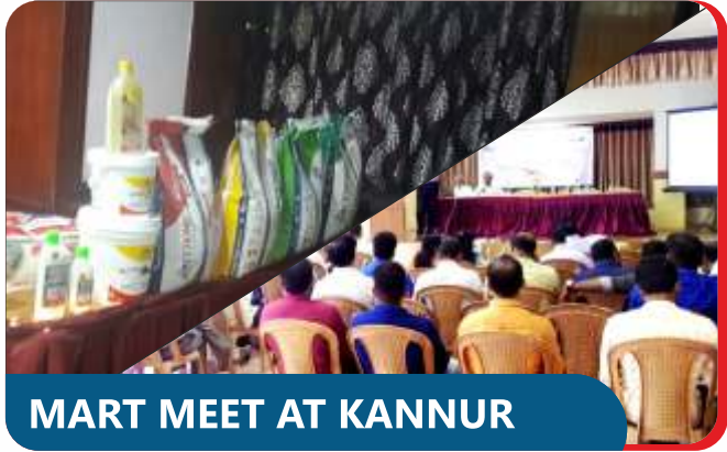
MART MEET AT KANNUR