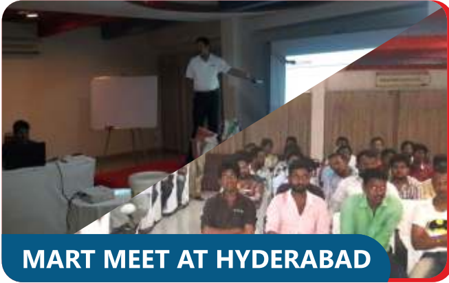
MART MEET AT HYDERABAD