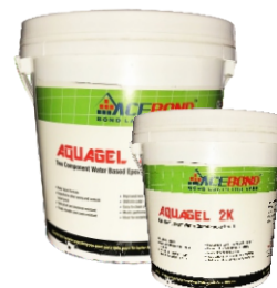
Aquagel 2K Two component Water based Epoxy grout

ACEBOND is introducing an innovative, water-based epoxy grout to the market that offers excellent chemical, acid and stain resistant properties. This is the first of its kind, two component, paste form water-based system in the Indian market and has been formulated specifically for ease of application and clean-up.