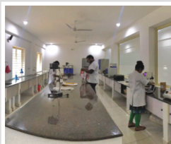
R & D lab