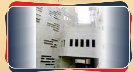
Project : "HEALTHWAY HOSPITAL", Old Goa, constructed by M/S R.B.S Candiaparcар