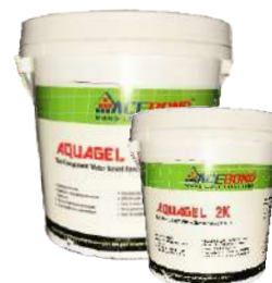
Aquagel 2K Two component Water based Epoxy grout

ACEBOND is introducing an innovative, water-based epoxy grout to the market that offers excellent chemical, acid and stain resistant properties. This is the first of its kind, two component, paste form water-based system in the Indian market and has been formulated specifically for ease of application and clean-up.