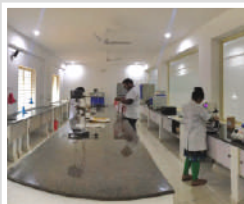
R & D lab